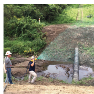
Highway / Oil / Gas / Pipeline